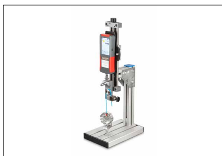
Can be mounted on all SAUTER test stands, illustration shows optional accessories, as well as the SAUTER TVL-XS manual test stand

The SAUTER FS premium force gauge is compatible with all SAUTER strain gauge measuring cells, see Measuring cells . Up to 4 external measuring cells can be connected simultaneously.