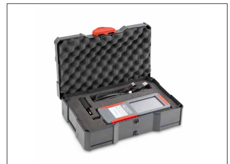
Supplied in a high-quality and robust system case (systainer® T-LOC) including plug-in power supply and USB cable type C