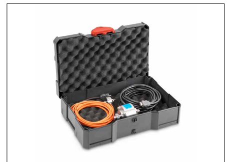
Tip: Order the practical system case (systainer® T-LOC) for storing and transporting of accessories, clamps, sensors, etc. at the same time, SAUTER FS TKZ, see Accessories