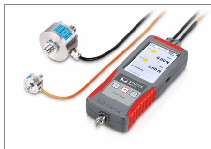
Simultaneous measurement on up to four channels. External sensors with sensor data memory, optionally available, see Measuring Cells