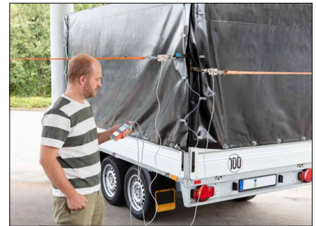
Measurement of forces in different tensile or compression directions possible with only one measuring device