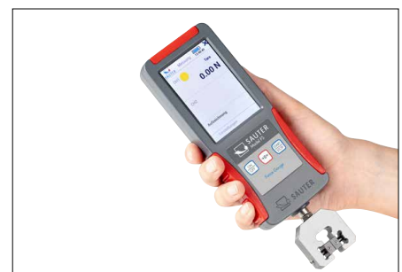
Compact force gauge with internal measuring cell (up to max. 500 N) for fast and mobile force measurements. Illustration shows optional accessories, SAUTER AE 500 screw tension clamp